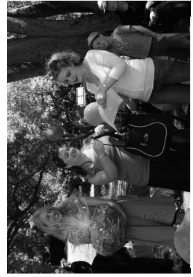
Having fun at the 2008 Xmas Picnic

We have one more fun, community-oriented event planned for the end of the year. Last year the Christmas Picnic was really enjoyable with games for the younger students, a raffle and a barbeque. I hope all of you will join in the fun again this year. There are literally no strings attached – no instruments are necessary – it is purely for fun and to celebrate our wonderful and successful Suzuki year!